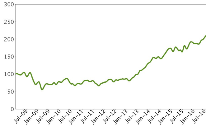
Hypothetical Historical Performance of the Basket

While actual historical information on the Basket did not exist before the pricing date, the following graph sets forth the hypothetical historical daily performance of the Basket from January 2008 through the pricing date. The graph is based upon actual daily historical prices of the Basket Stocks, hypothetical Component Ratios based on the closing prices of the Basket Stocks as of December 31, 2007, and a Basket value of 100.00 as of that date. This hypothetical historical data on the Basket is not necessarily indicative of the future performance of the Basket or what the value of the notes may be. Any hypothetical historical upward or downward trend in the value of the Basket during any period set forth below is not an indication that the value of the Basket is more or less likely to increase or decrease at any time over the term of the notes.