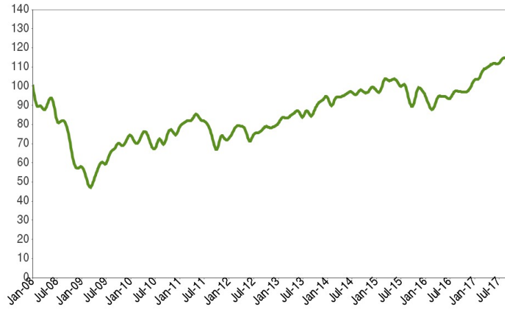
Hypothetical Historical Performance of the Basket

While actual historical information on the Basket will not exist before the pricing date, the following graph sets forth the hypothetical historical daily performance of the Basket from January 1, 2008 through October 17, 2017. The graph is based upon actual daily historical levels of the Basket Components, hypothetical Component Ratios based on the closing levels of the Basket Components as of December 31, 2007, and a Basket value of 100.00 as of that date. This hypothetical historical data on the Basket is not necessarily indicative of the future performance of the Basket or what the value of the notes may be. Any hypothetical historical upward or downward trend in the value of the Basket during any period set forth below is not an indication that the value of the Basket is more or less likely to increase or decrease at any time over the term of the notes.