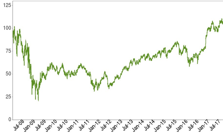
Hypothetical Historical Performance of the Basket

While actual historical information on the Basket will not exist before the pricing date, the following graph sets forth the hypothetical historical daily performance of the Basket from January 1, 2008 through October 27, 2017. The graph is based upon actual daily historical prices of the Basket Stocks, hypothetical Component Ratios based on the closing prices of the Basket Stocks as of December 31, 2007, and a Basket value of 100.00 as of that date. This hypothetical historical data on the Basket is not necessarily indicative of the future performance of the Basket or what the value of the notes may be. Any hypothetical historical upward or downward trend in the value of the Basket during any period set forth below is not an indication that the value of the Basket is more or less likely to increase or decrease at any time over the term of the notes.