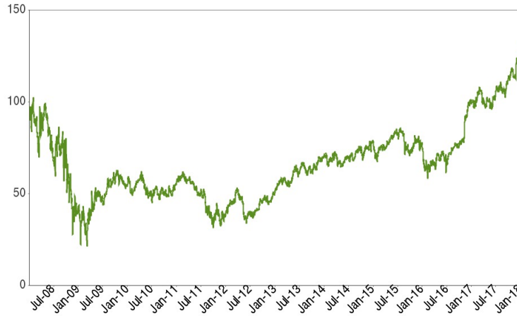
Hypothetical Historical Performance of the Basket

While actual historical information on the Basket will not exist before the pricing date, the following graph sets forth the hypothetical historical daily performance of the Basket from January 1, 2008 through January 19, 2018. The graph is based upon actual daily historical prices of the Basket Stocks, hypothetical Component Ratios based on the closing prices of the Basket Stocks as of December 31, 2007, and a Basket value of 100.00 as of that date. This hypothetical historical data on the Basket is not necessarily indicative of the future performance of the Basket or what the value of the notes may be. Any hypothetical historical upward or downward trend in the value of the Basket during any period set forth below is not an indication that the value of the Basket is more or less likely to increase or decrease at any time over the term of the notes.