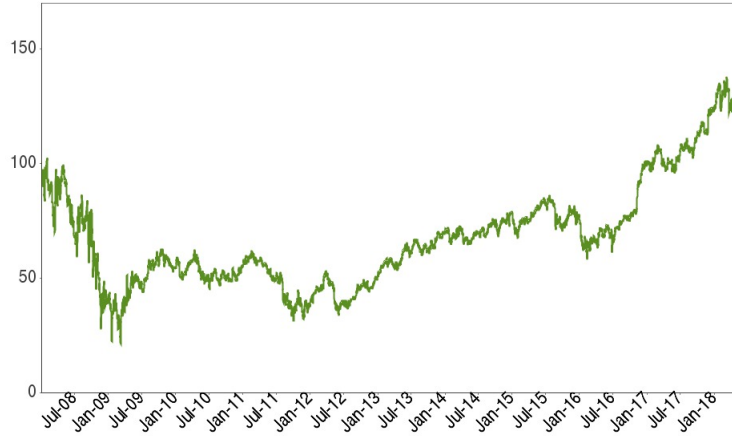
Hypothetical Historical Performance of the Basket

While actual historical information on the Basket did not exist before the pricing date, the following graph sets forth the hypothetical historical daily performance of the Basket from January 1, 2008 through May 24, 2018. The graph is based upon actual daily historical prices of the Basket Stocks, hypothetical Component Ratios based on the closing prices of the Basket Stocks as of December 31, 2007, and a Basket value of 100.00 as of that date. This hypothetical historical data on the Basket is not necessarily indicative of the future performance of the Basket or what the value of the notes may be. Any hypothetical historical upward or downward trend in the value of the Basket during any period set forth below is not an indication that the value of the Basket is more or less likely to increase or decrease at any time over the term of the notes.