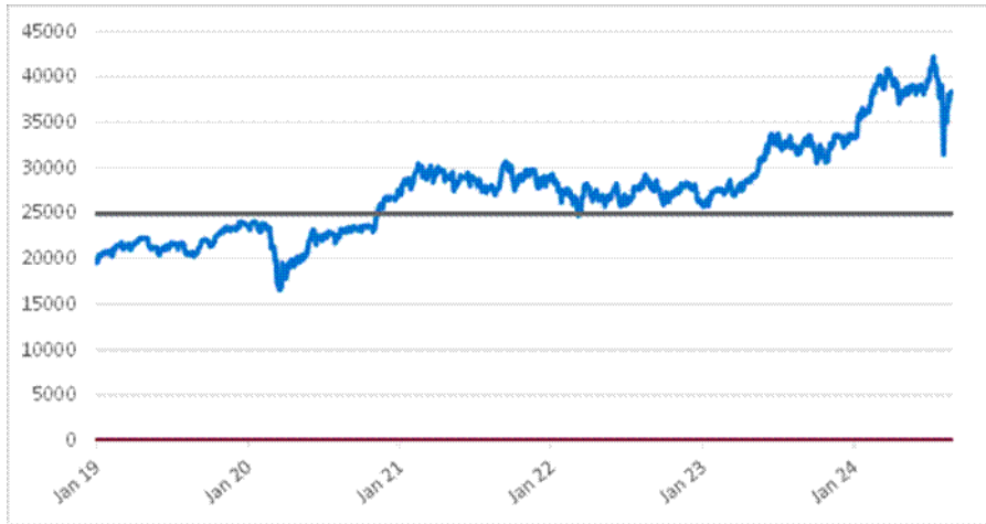
NKY Daily Closing Values January 2, 2019 to August 23, 2024

*The solid line in the graph indicates the coupon barrier level and the downside threshold level, which in each case is 65% of the initial index value.