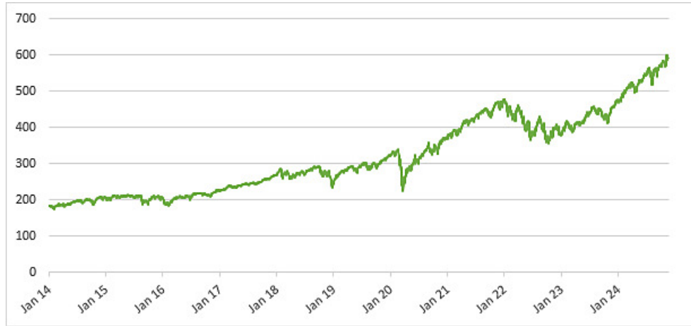
Historical Performance of the SPY

This historical data on the SPY is not necessarily indicative of the future performance of the SPY or what the value of the notes may be. Any historical upward or downward trend in the price of the SPY during any period set forth above is not an indication that the price of the SPY is more or less likely to increase or decrease at any time over the term of the notes.