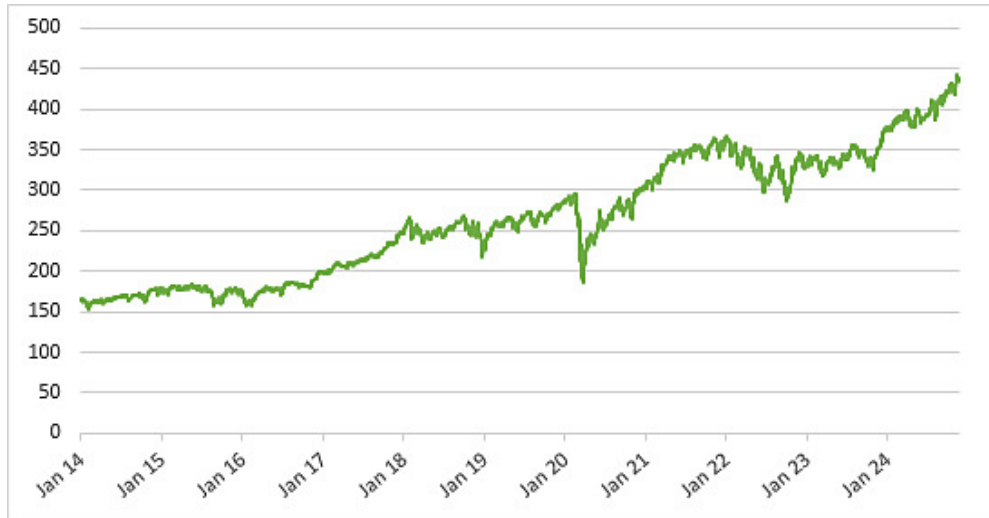
Historical Performance of the DIA

This historical data on the DIA is not necessarily indicative of the future performance of the DIA or what the value of the notes may be. Any historical upward or downward trend in the price of the DIA during any period set forth above is not an indication that the price of the DIA is more or less likely to increase or decrease at any time over the term of the notes.