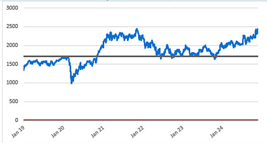
RTY Daily Closing Values January 2, 2019 to November 25, 2024

*The solid line in the graph indicates the hypothetical coupon barrier level and the hypothetical downside threshold level, which in each case is 70% of the hypothetical initial index value on November 25, 2024.