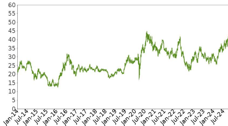
Historical Performance of the Underlying Fund

This historical data on the Underlying Fund is not necessarily indicative of the future performance of the Underlying Fund or what the value of the notes may be. Any historical upward or downward trend in the price of the Underlying Fund during any period set forth above is not an indication that the price of the Underlying Fund is more or less likely to increase or decrease at any time over the term of the notes.