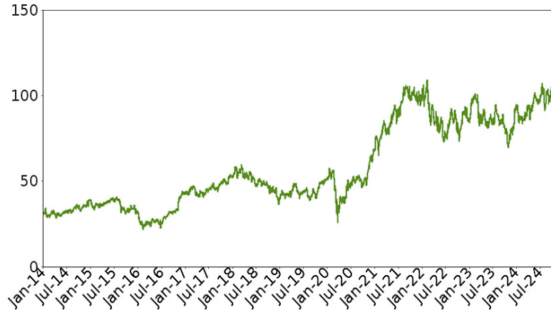
Historical Performance of MS

This historical data on MS is not necessarily indicative of the future performance of MS or what the value of the notes may be. Any historical upward or downward trend in the price per share of MS during any period set forth above is not an indication that the price per share of MS is more or less likely to increase or decrease at any time over the term of the notes.