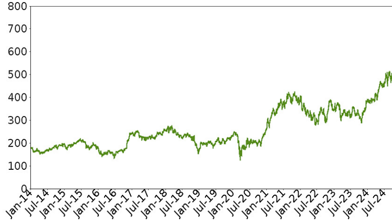
Historical Performance of GS

This historical data on GS is not necessarily indicative of the future performance of GS or what the value of the notes may be. Any historical upward or downward trend in the price per share of GS during any period set forth above is not an indication that the price per share of GS is more or less likely to increase or decrease at any time over the term of the notes.