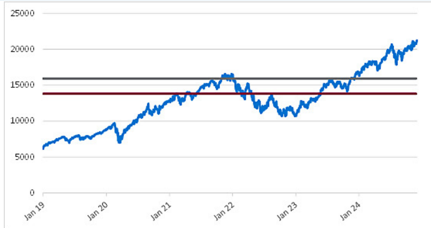
NDX Daily Closing Values January 2, 2019 to December 3, 2024

*The gray solid line in the graph indicates the hypothetical coupon barrier level and the crimson solid line in the graph indicates the hypothetical downside threshold level, in each case assuming the index closing value on December 3, 2024 were the initial index value.