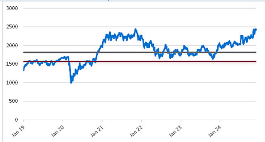
RTY Daily Closing Values January 2, 2019 to December 3, 2024

*The gray solid line in the graph indicates the hypothetical coupon barrier level and the crimson solid line in the graph indicates the hypothetical downside threshold level, in each case assuming the index closing value on December 3, 2024 were the initial index value.