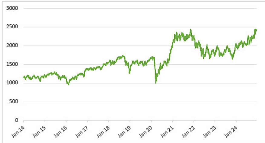
Historical Performance of the Index

This historical data on the Index is not necessarily indicative of the future performance of the Index or what the value of the notes may be. Any historical upward or downward trend in the level of the Index during any period set forth above is not an indication that the level of the Index is more or less likely to increase or decrease at any time over the term of the notes.