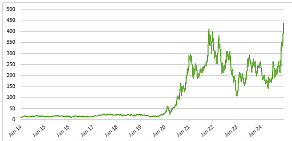
Historical Performance of the Underlying Stock

The following graph shows the daily historical performance of the Underlying Stock on its primary exchange for the period from January 1, 2014 through the Strike Date. We obtained this historical data from Bloomberg L.P. We have not independently verified the accuracy or completeness of the information obtained from Bloomberg L.P. On the Strike Date, the Closing Market Price of the Underlying Stock was $436.23. The graph below may have been adjusted to reflect certain corporate actions such as stock splits and reverse stock splits.