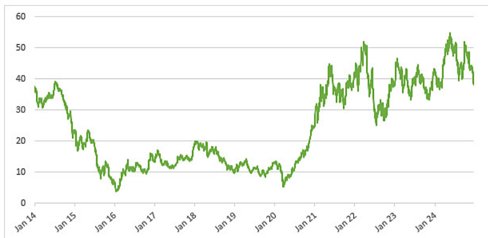
Historical Performance of the Underlying Stock

This historical data on the Underlying Stock is not necessarily indicative of the future performance of the Underlying Stock or what the value of the notes may be. Any historical upward or downward trend in the price per share of the Underlying Stock during any period set forth above is not an indication that the price per share of the Underlying Stock is more or less likely to increase or decrease at any time over the term of the notes.