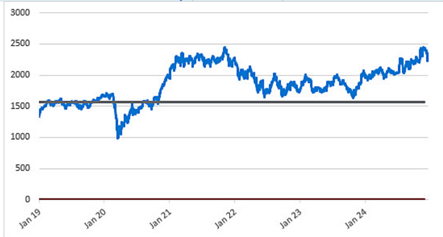
RTY Daily Closing Values January 2, 2019 to December 20, 2024

*The solid line in the graph indicates the coupon barrier level and the downside threshold level, which in each case is 70% of the initial index value.