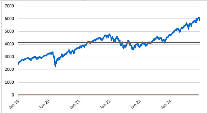
SPX Daily Closing Values January 2, 2019 to December 20, 2024

*The solid line in the graph indicates the coupon barrier level and the downside threshold level, which in each case is 70% of the initial index value.