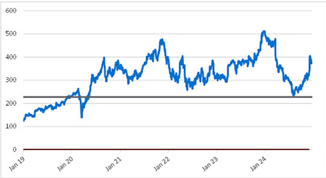
Common Stock of lululemon athletica inc. – Daily Closing Prices January 2, 2019 to December 20, 2024