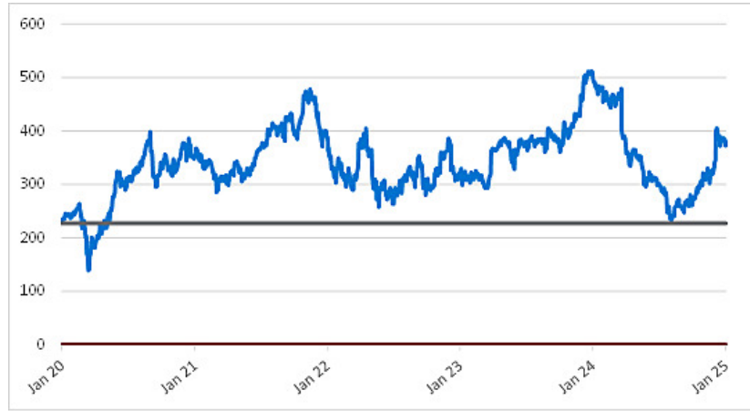
Common Stock of lululemon athletica inc. – Daily Closing Prices January 2, 2020 to January 3, 2025

*The gray solid line indicates the downside threshold price, which is 60% of the initial share price.