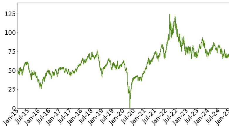
Historical Performance of the Market Measure

This historical data on the WTI Crude Oil Futures Contract is not necessarily indicative of its future performance or what the value of the notes may be. Any historical upward or downward trend in the price of the WTI Crude Oil Futures Contract during any period set forth above is not an indication that the price of the WTI Crude Oil Futures Contract is more or less likely to increase or decrease at any time over the term of the notes.