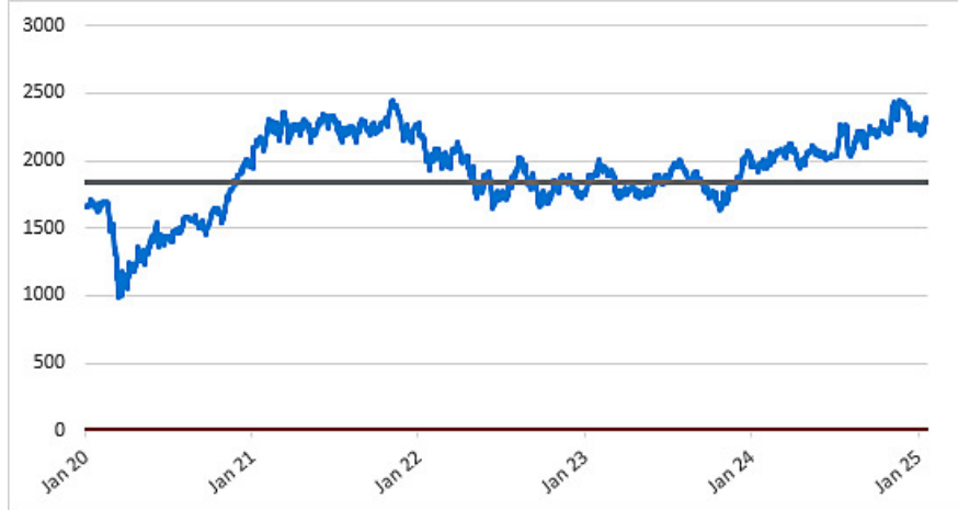
RTY Daily Closing Values January 2, 2020 to January 22, 2025

*The grey solid line in the graph indicates the hypothetical downside threshold level, which is 80% of the hypothetical initial index value on January 22, 2025.