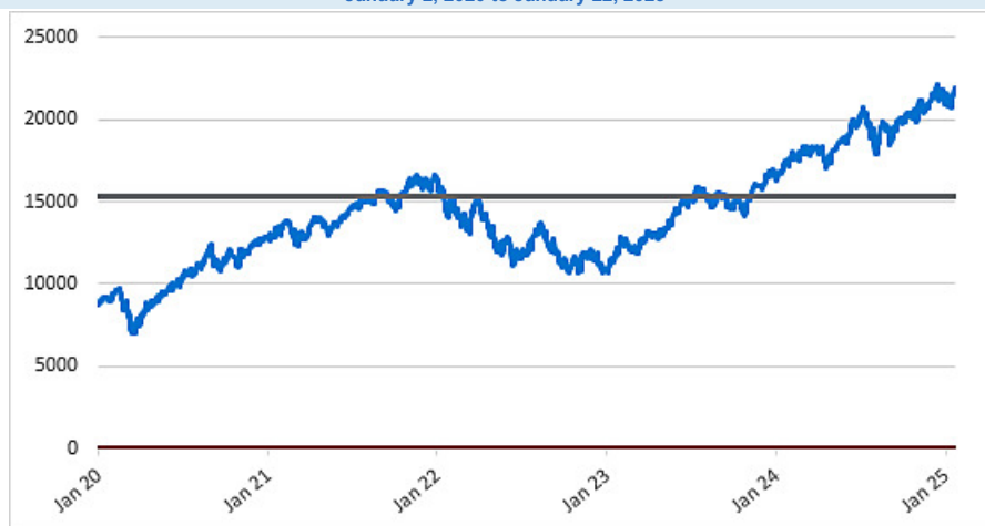
NDX Daily Closing Values January 2, 2020 to January 22, 2025

*The solid line in the graph indicates the hypothetical coupon barrier level and the hypothetical downside threshold level, which in each case is 70% of the hypothetical initial index value on January 22, 2025.