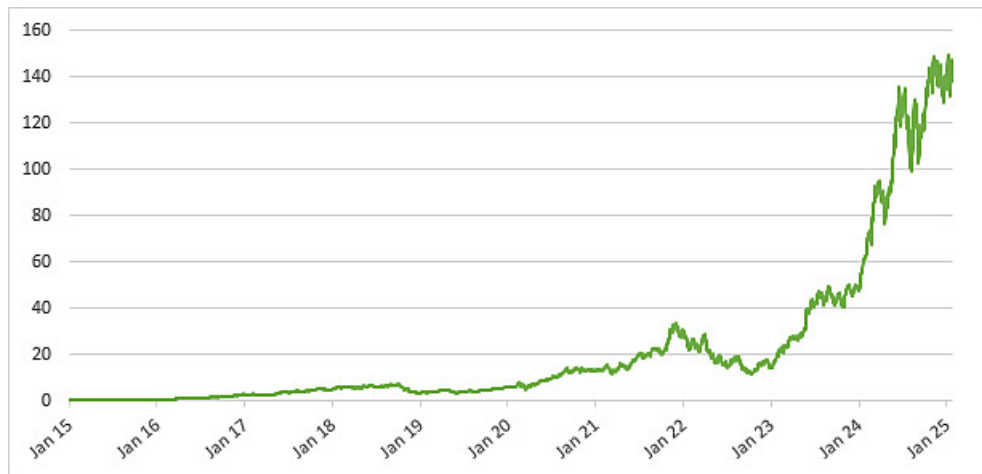
Historical Performance of the Underlying Stock

This historical data on the Underlying Stock is not necessarily indicative of the future performance of the Underlying Stock or what the value of the notes may be. Any historical upward or downward trend in the price of the Underlying Stock during any period set forth above is not an indication that the price of the Underlying Stock is more or less likely to increase or decrease at any time over the term of the notes.