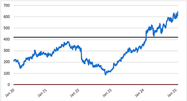
Class A Common Stock of Meta Platforms, Inc. – Daily Closing Prices January 2, 2020 to January 24, 2025

*The gray solid line indicates the downside threshold price, which is 65% of the initial share price.