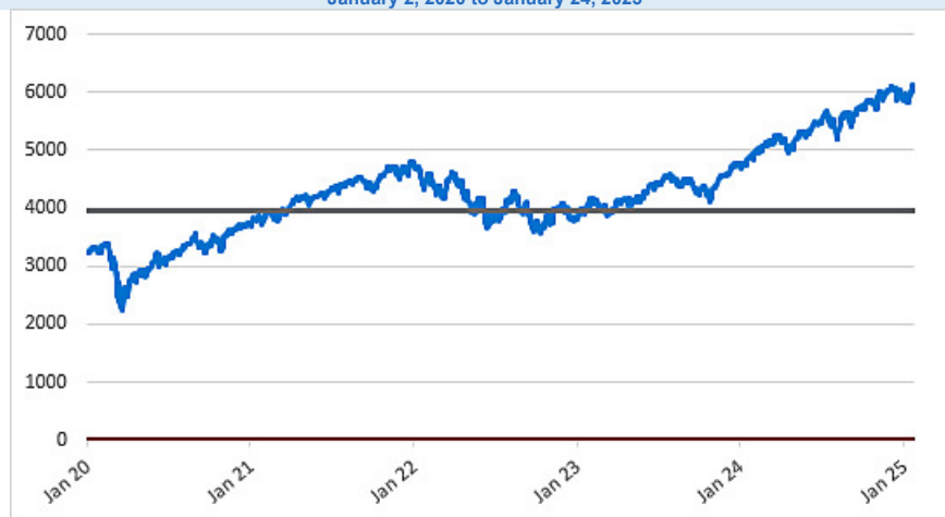
SPX Daily Closing Values January 2, 2020 to January 24, 2025

*The solid line in the graph indicates the coupon barrier level and the downside threshold level, which in each case is 65% of the initial index value.