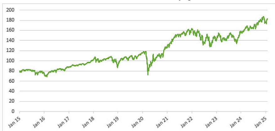
Historical Performance of the Underlying Fund

This historical data on the Underlying Fund is not necessarily indicative of the future performance of the Underlying Fund or what the value of the notes may be. Any historical upward or downward trend in the price of the Underlying Fund during any period set forth above is not an indication that the price per share of the Underlying Fund is more or less likely to increase or decrease at any time over the term of the notes.