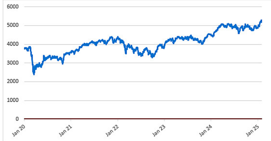
SX5E Daily Index Closing Values January 2, 2020 to January 31, 2025

The following graph sets forth the daily index closing values of the SX5E for the period from January 2, 2020 through the pricing date. The related table sets forth the published high and low index closing values, as well as end-of-quarter index closing values, of the SX5E for each quarter in the same period. The index closing value of the SX5E on the pricing date was 5,286.87. We obtained the information in the graph and table below from Bloomberg L.P., without independent verification. The SX5E has at times experienced periods of high volatility, and you should not take the historical values of the SX5E as an indication of its future performance. No assurance can be given as to the level of the SX5E on the valuation date.