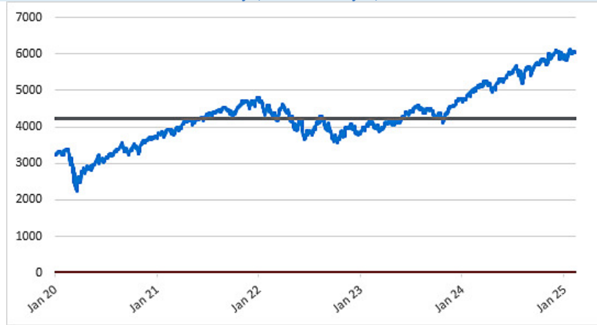
SPX Daily Closing Values January 2, 2020 to February 12, 2025

*The solid line in the graph indicates the hypothetical coupon barrier level and the hypothetical downside threshold level, which in each case is 70% of the hypothetical initial index value on February 12, 2025.