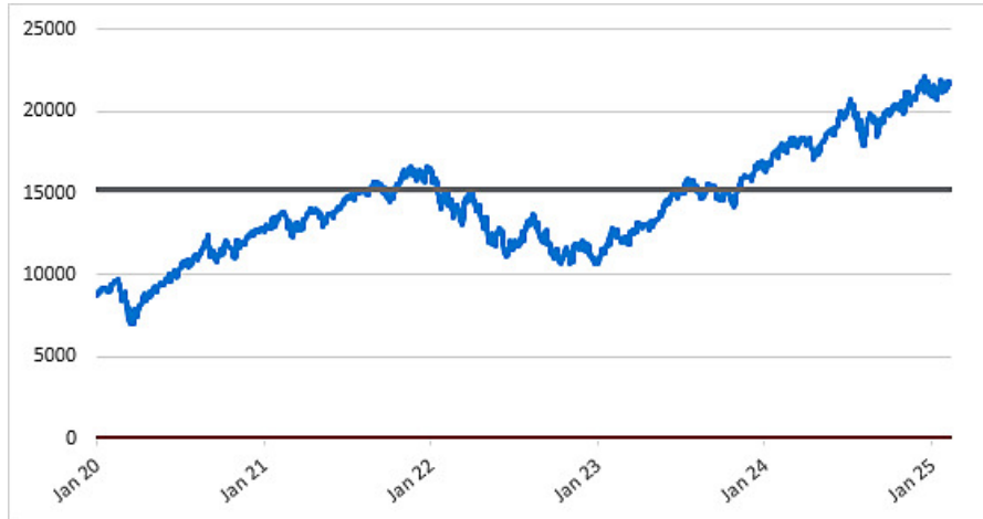
NDX Daily Closing Values January 2, 2020 to February 12, 2025

*The solid line in the graph indicates the hypothetical coupon barrier level and the hypothetical downside threshold level, which in each case is 70% of the hypothetical initial index value on February 12, 2025.