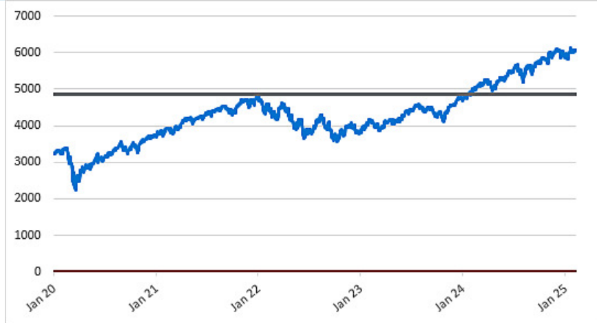
SPX Daily Closing Values January 2, 2020 to February 10, 2025

*The grey solid line in the graph indicates the hypothetical trigger level, which is 80% of the hypothetical initial index value on February 10, 2025.