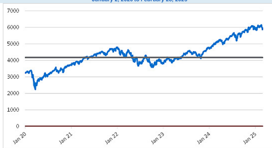
SPX Daily Closing Values January 2, 2020 to February 28, 2025

*The solid line in the graph indicates the hypothetical coupon barrier level and the hypothetical downside threshold level, which in each case is 70% of the hypothetical initial index value on February 28, 2025.