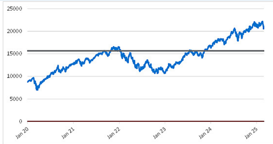
NDX Daily Closing Values January 2, 2020 to February 28, 2025

*The solid line in the graph indicates the coupon barrier level and the downside threshold level, which in each case is 75% of the initial index value.