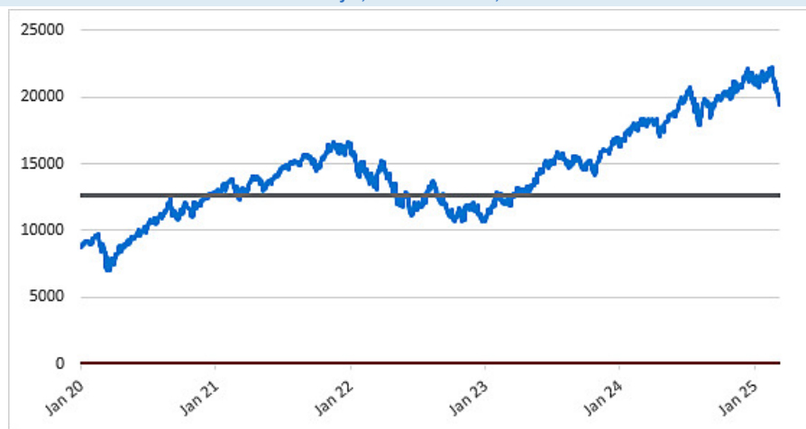
NDX Daily Closing Values January 2, 2020 to March 10, 2025

*The solid line in the graph indicates the coupon barrier level and the downside threshold level, which in each case is 65% of the initial index value.