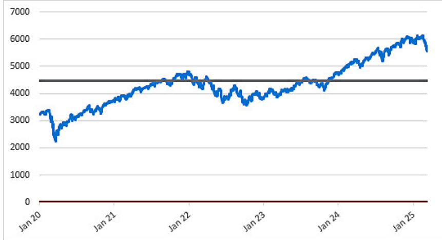
SPX Daily Closing Values January 2, 2020 to March 11, 2025

*The grey solid line in the graph indicates the hypothetical downside threshold level, which is 80% of the hypothetical initial index value on March 11, 2025.