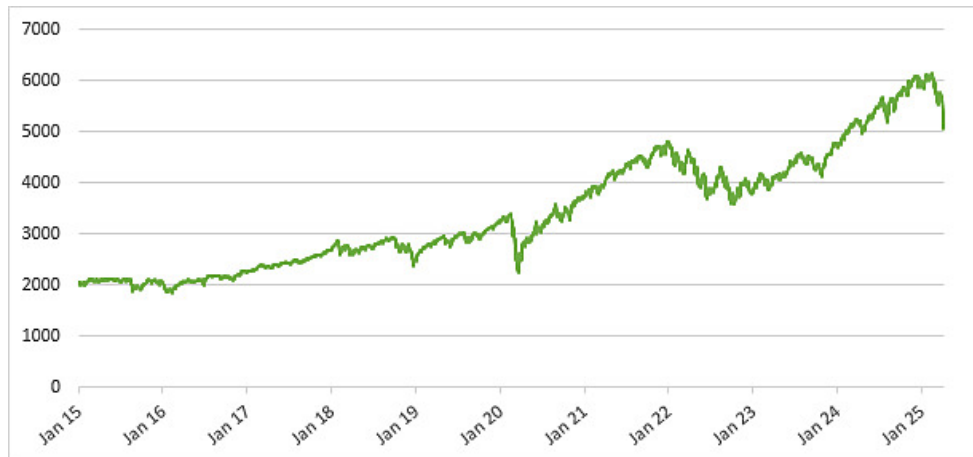
Historical Performance of the SPX

This historical data on the SPX is not necessarily indicative of the future performance of the SPX or what the value of the notes may be. Any historical upward or downward trend in the level of the SPX during any period set forth above is not an indication that the level of the SPX is more or less likely to increase or decrease at any time over the term of the notes.