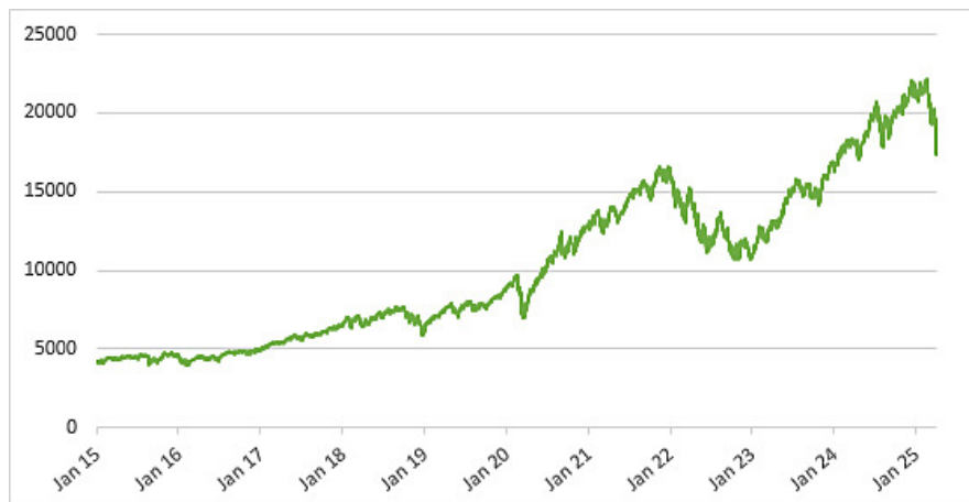
Historical Performance of the NDX

This historical data on the NDX is not necessarily indicative of the future performance of the NDX or what the value of the notes may be. Any historical upward or downward trend in the level of the NDX during any period set forth above is not an indication that the level of the NDX is more or less likely to increase or decrease at any time over the term of the notes.