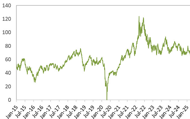
Historical Performance of the First Nearby Month Futures Contract for WTI Light Sweet Crude Oil

This historical data on the WTI Crude Oil Futures Contract is not necessarily indicative of its future performance or what the value of the notes may be. Any historical upward or downward trend in the price of the WTI Crude Oil Futures Contract during any period set forth above is not an indication that the price of the WTI Crude Oil Futures Contract is more or less likely to increase or decrease at any time over the term of the notes.