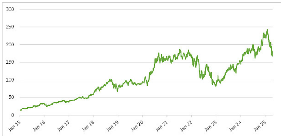
Historical Performance of the Underlying Stock

This historical data on the Underlying Stock is not necessarily indicative of the future performance of the Underlying Stock or what the value of the notes may be. Any historical upward or downward trend in the price per share of the Underlying Stock during any period set forth above is not an indication that the price per share of the Underlying Stock is more or less likely to increase or decrease at any time over the term of the notes.