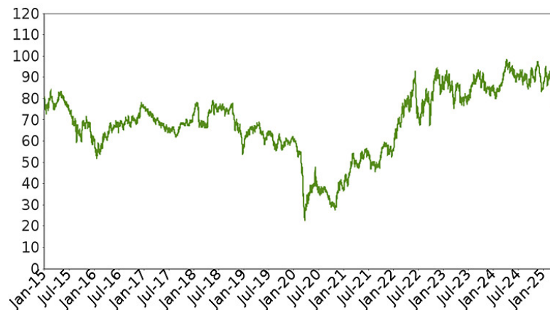
Historical Performance of the Underlying Fund

This historical data on the Underlying Fund is not necessarily indicative of the future performance of the Underlying Fund or what the value of the notes may be. Any historical upward or downward trend in the price of the Underlying Fund during any period set forth above is not an indication that the price of the Underlying Fund is more or less likely to increase or decrease at any time over the term of the notes.