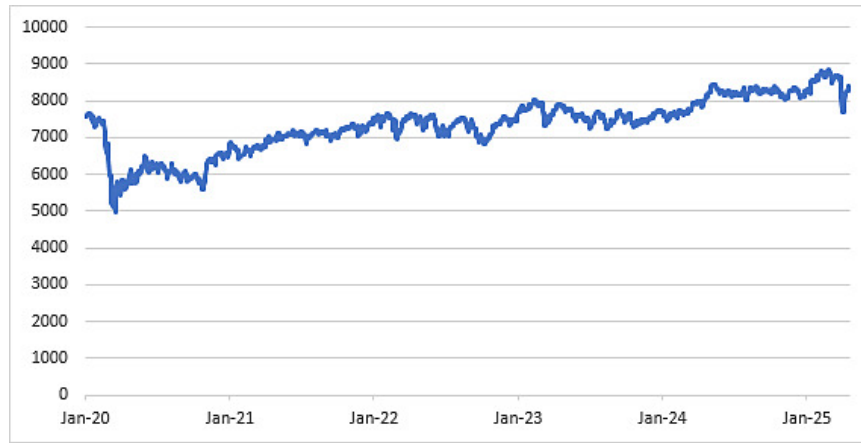
Historical Performance of the Swiss Market Index