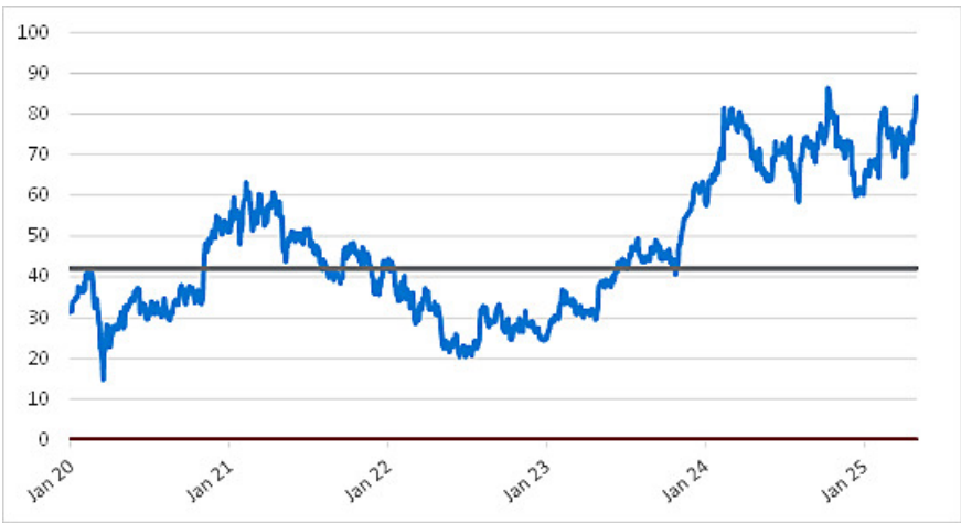
Common Stock of Uber Technologies, Inc. – Daily Closing Prices January 2, 2020 to May 2, 2025

*The gray solid line indicates the downside threshold price, which is 50% of the initial share price.