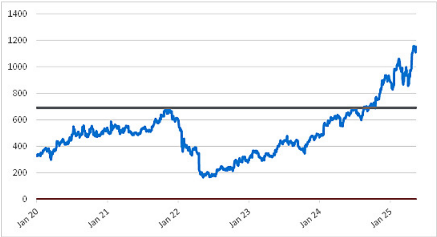
Common Stock of Netflix, Inc. – Daily Closing Prices January 2, 2020 to May 14, 2025

*The gray solid line indicates the hypothetical downside threshold price, which is 60% of the hypothetical initial share price as of May 14, 2025.