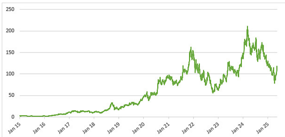
Historical Performance of the Underlying Stock

The following graph shows the daily historical performance of the Underlying Stock on its primary exchange for the period from January 1, 2015 through May 15, 2025. We obtained this historical data from Bloomberg L.P. We have not independently verified the accuracy or completeness of the information obtained from Bloomberg L.P. On May 15, 2025, the Closing Market Price of the Underlying Stock was $114.99. The graph below may have been adjusted to reflect certain corporate actions such as stock splits and reverse stock splits.