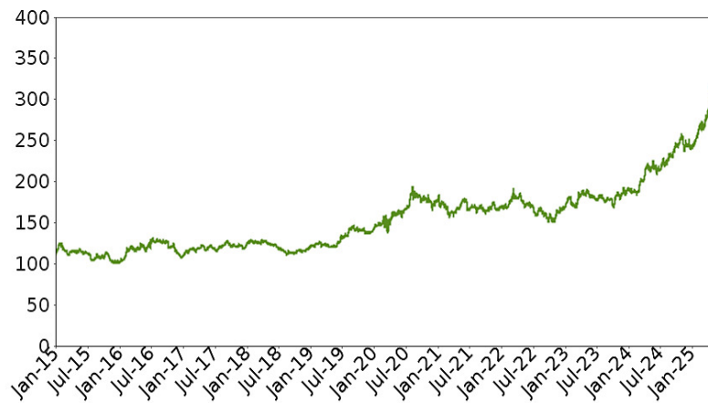
Historical Performance of the Underlying Fund

This historical data on the Underlying Fund is not necessarily indicative of the future performance of the Underlying Fund or what the value of the notes may be. Any historical upward or downward trend in the price of the Underlying Fund during any period set forth above is not an indication that the price of the Underlying Fund is more or less likely to increase or decrease at any time over the term of the notes.