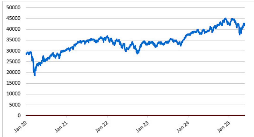
INDU Daily Index Closing Values January 2, 2020 to May 23, 2025

The following graph sets forth the daily index closing values of the INDU for the period from January 2, 2020 through the strike date. The related table sets forth the published high and low index closing values, as well as end-of-quarter index closing values, of the INDU for each quarter in the same period. The index closing value of the INDU on the strike date was 41,603.07. We obtained the information in the graph and table below from Bloomberg L.P., without independent verification. The INDU has at times experienced periods of high volatility, and you should not take the historical values of the INDU as an indication of its future performance. No assurance can be given as to the closing level of the INDU on any of the final averaging dates.