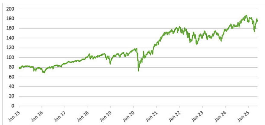
Historical Performance of the Underlying Fund

This historical data on the Underlying Fund is not necessarily indicative of the future performance of the Underlying Fund or what the value of the notes may be. Any historical upward or downward trend in the price of the Underlying Fund during any period set forth above is not an indication that the price per share of the Underlying Fund is more or less likely to increase or decrease at any time over the term of the notes.