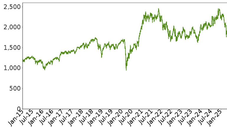
Historical Performance of the Index

This historical data on the Index is not necessarily indicative of the future performance of the Index or what the value of the notes may be. Any historical upward or downward trend in the level of the Index during any period set forth above is not an indication that the level of the Index is more or less likely to increase or decrease at any time over the term of the notes.