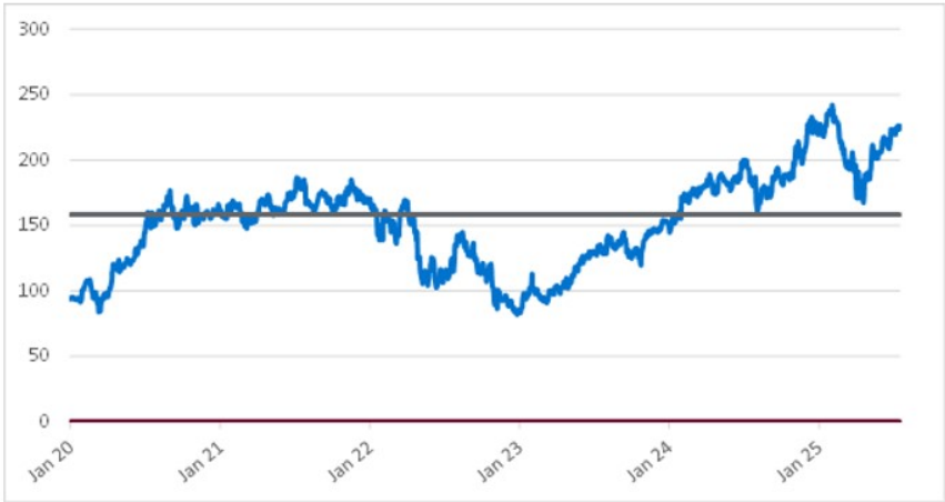
Common Stock of Amazon.com, Inc. – Daily Closing Prices January 2, 2020 to July 18, 2025

*The gray solid line indicates the downside threshold price, which is 70% of the initial share price.