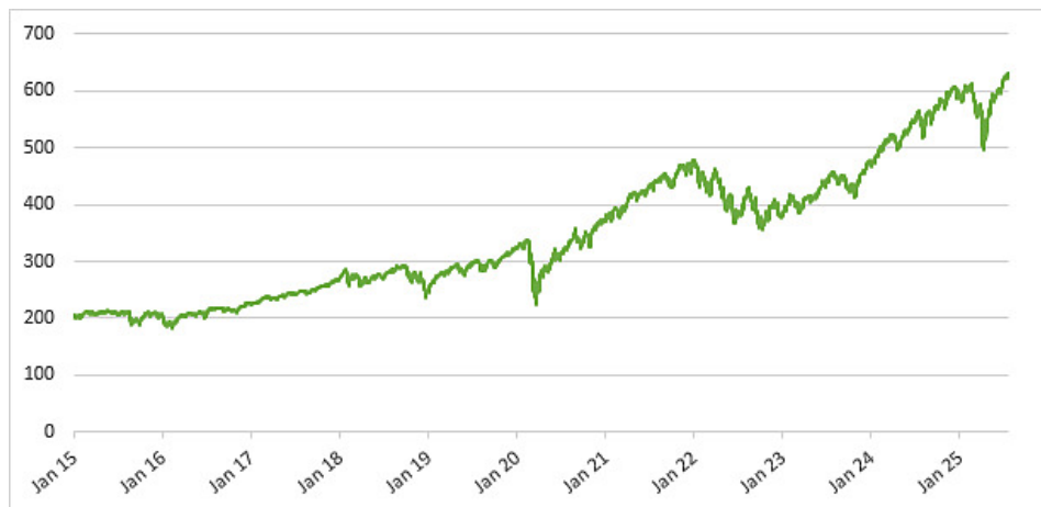
Historical Performance of the SPY

This historical data on the SPY is not necessarily indicative of the future performance of the SPY or what the value of the notes may be. Any historical upward or downward trend in the price of the SPY during any period set forth above is not an indication that the price of the SPY is more or less likely to increase or decrease at any time over the term of the notes.