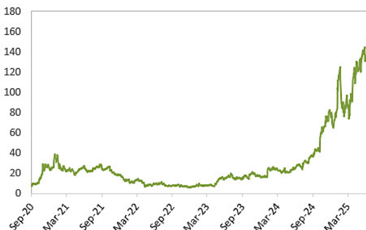
Historical Performance of the Underlying Stock

This historical data on the Underlying Stock is not necessarily indicative of the future performance of the Underlying Stock or what the value of the notes may be. Any historical upward or downward trend in the price of the Underlying Stock during any period set forth above is not an indication that the price of the Underlying Stock is more or less likely to increase or decrease at any time over the term of the notes.