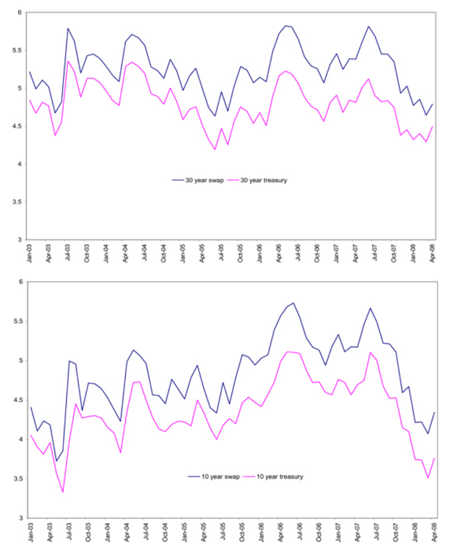
Interest payable on the Notes will depend on the spread between long-term interest rates (as measured by CMS30) and short-term interest rates (as measured by CMS10). Although long-term interest rates directionally follow short-term interest rates, long-term interest rates tend to lag short-term interest rates in magnitude. Specifically, when short-term interest rates rise, the spread between CMS30 and CMS10 tends to narrow (curve of the spread flattens); conversely, when short-term interest rates fall, the spread widens (curve becomes steeper).

through April 2008; the second graph reflects the correlation between the month-end 10-year U.S. Dollar Constant Maturity Swap Rate relative to the month-end 10-year Treasury Rate during the same period.