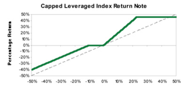
Market Measure Movement

This graph reflects the hypothetical returns on the Notes, including the Participation Rate of 200% and the Capped Value of 45.5%. The green line reflects the hypothetical returns on the Notes, while the gray dashed-line reflects the return of a hypothetical direct investment in the stocks included in the Index, excluding dividends.